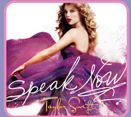
The cover of Swift's album Speak Now , which was released in 2010 and is Swift's third album. One song from this album, "Enchanted," is a permanent part of the

Another concern with the setlist was that none of the songs from Swift's debut album, Taylor Swift , are a permanent part of the concert. She has played "Tim McGraw," "Our Song," "A Place in This World," and "Cold As You" only as surprise songs, so not everyone got to hear it live at every location.