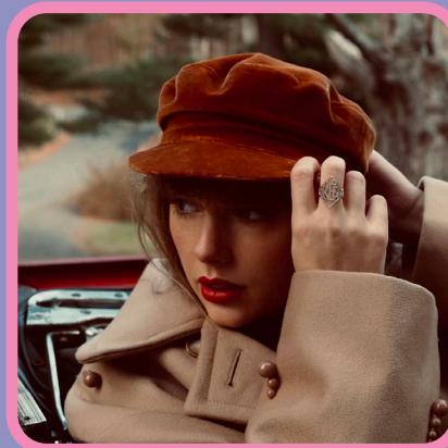
The cover for Swift's album released in 2022, Red (Taylor's Version) which is the re-recording of the original album, Red . Now that Swift has recorded the new version, she owns all of the songs on the album plus the new vault tracks she added.

Although we agree with most of Swift's song choices, there are a few changes we would make. The element of surprise songs is a great idea, but it doesn't guarantee fans will get to hear certain songs because of Swift's rule