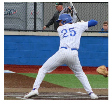
Up to bat against Watkins on Senior day. Liberty won 5-3.